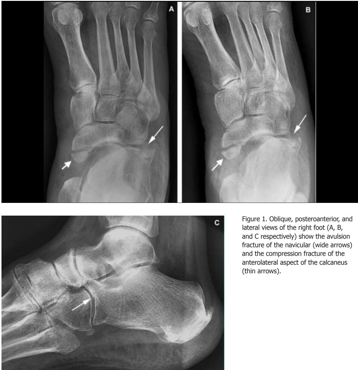
Figure 1. Oblique, posteroanterior, and lateral views of the right foot (A, B, and C respectively) show the avulsion fracture of the navicular (wide arrows) and the compression fracture of the anterolateral aspect of the calcaneus (thin arrows).

disorder was found down in an awkward position by her husband, reportedly with brief loss of consciousness at the scene. She was brought into the emergency department by her husband the following day, with altered mental status and complaints of right ankle and foot pain. Due to her post-ictal state, she was unable to provide further details regarding the mechanism of injury. Initial imaging included computed tomography