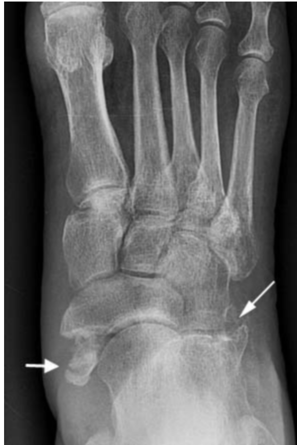
Figure 3. Posteroanterior view of the right foot at 3 months following the injury. The compression deformity of the calcaneus persists (wide arrow), and the navicular fracture is fragmented and further distracted, consistent with non-union (narrow arrow).

The navicular is crucial for maintaining the medial longitudinal arch and Chopart joints of the foot. The tibialis posterior tendon, which inserts at the tuberosity of the navicular, also plays an important role in this regard. Therefore, the intact navicular and tibialis posterior tendon together play a vital role in the structural integrity and weight-bearing function of the foot,