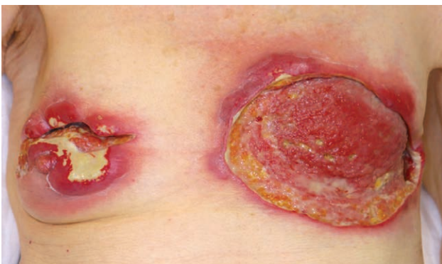
Fig. 2. The findings on day 9 after debridement surgery. The characteristic necrotic ulcer with an irregular, violaceous and undermined border indicated pyoderma gangrenosum.

dermis. Scale bar: 100 \mu m. http://links.lww.com/PRSGO/B925 .) Oral administration of prednisolone 30 mg/day from day 10 after debridement surgery improved the symptoms of erythema and pain while reducing the discharge from wounds. We performed NPWT (V.A.C. Ultra; KCI, San Antonio, Tex.) with a negative pressure of 125 mm Hg and instillation and dwelling every 4h from day 16 after debridement surgery. After gradually reducing the oral steroid intake to 12.5 mg/day, we planned to perform skin grafting surgery. (Supplemental Digital Content 1, http://links.lww.com/PRSGO/B924 .) (Supplemental Digital Content 2, http://links.lww.com/PRSGO/B925 .)