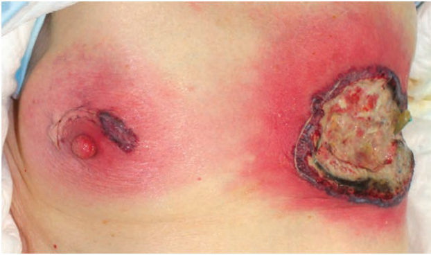
Fig. 1. Rapid development of painful bilateral ulcers along incision sites 12 days after breast cancer resection.