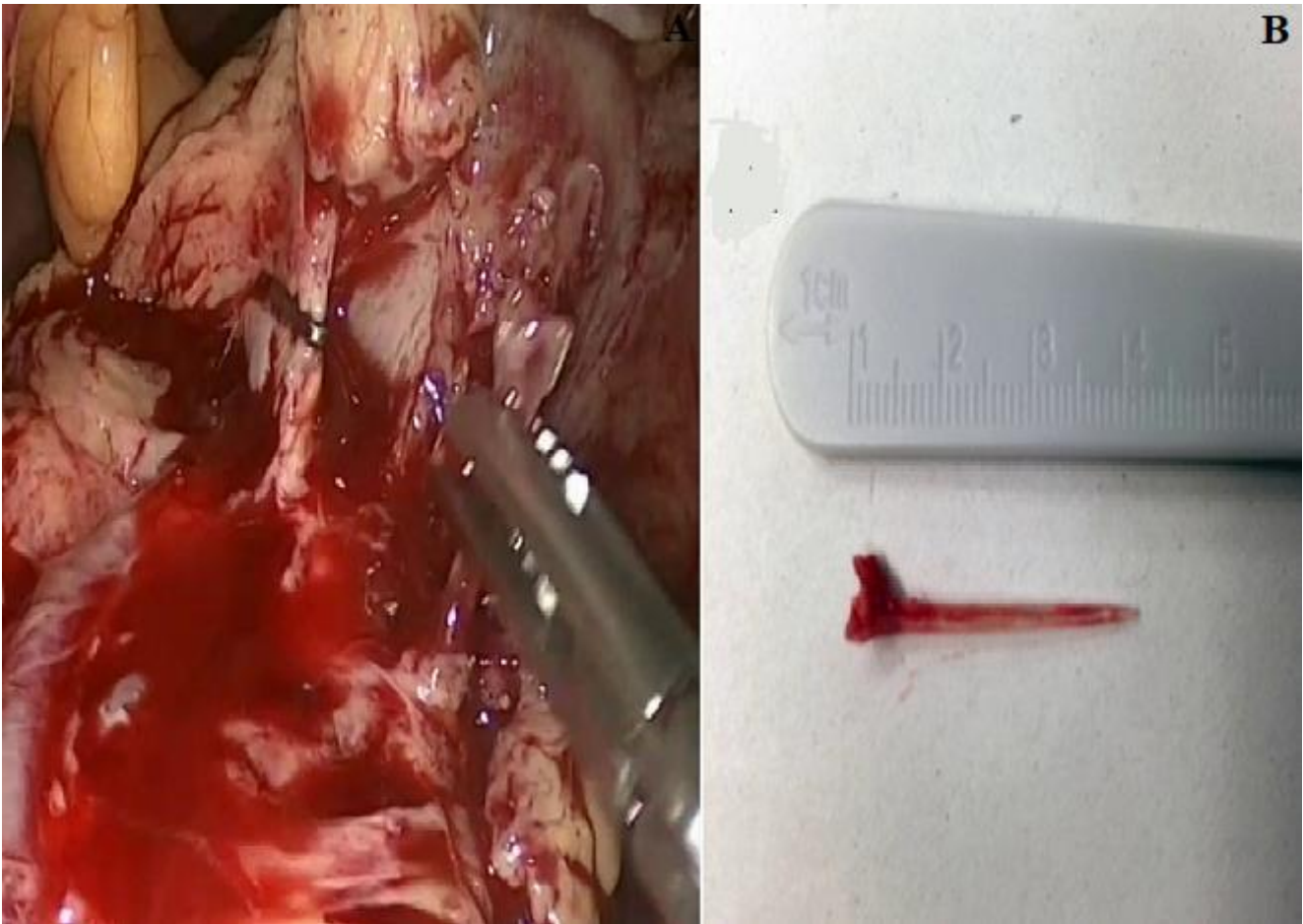
Figure 2: a linear foreign body was found between the prepyloric region of the stomach and the pancreatic head and was safely removed from both pancreas and stomach laparoscopically (A); the foreign body was identified as a 3-cm-long fish bone (B)