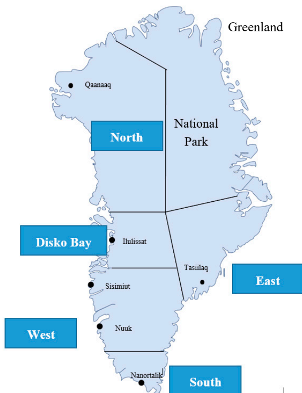
Figure 1. Map of Greenland divided into five regions with indication of residential areas.

The criteria for inclusion were pregnant Inuit women \geq 18 years of age who had lived more than 50% of their lives in Greenland.