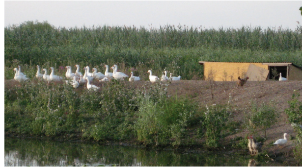
FIGURE 2: Photograph of a typical sentinel bird shelter, Caraorman site, Danube Delta, September 2010.

2.3. Ethical Statement. Actions were taken to ensure animal health and well-being throughout the study via enlisting licensed public health veterinarians from the Tulcea County