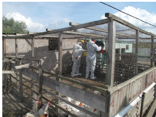
FIGURE 3: Photograph of a sentinel bird surveillance site, Danube Delta, October 2013.

Health Department to collect sera and swabs from the sentinel birds. Additionally, the study was approved by the Institutional Animal Care and Use Committee (IACUC) at the University of Florida.