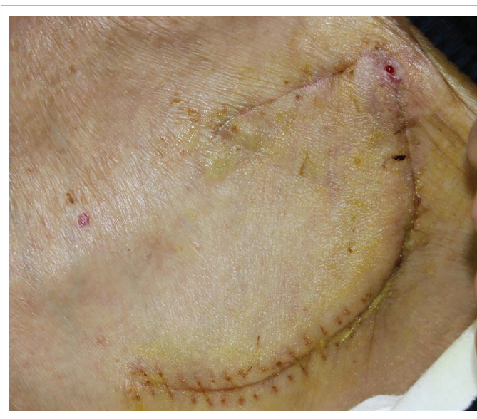
Figure 4. Immediate and early-stage postoperative follow-up.

range between 0% and 12.6% in different series. [2] It is assumed that exposure develops as a result of mechanical forces or infection. We think that in the cases we shared these exposures occur as a result of atrophy developed as a consequence of aging and mechanical irritation of pacemaker.