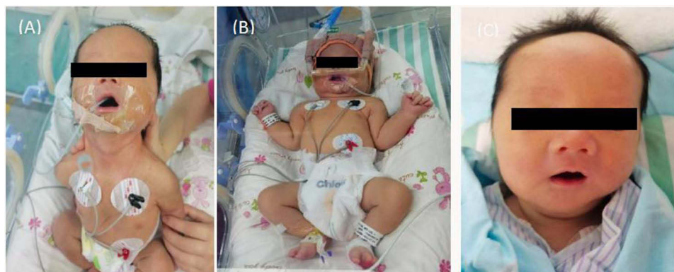
Figure 1 (A) Generalized hypotonia with marked poor head erect and suck ability. (B) Need auxiliary ventilation for muscular disorders especially respiratory muscle weakness. (C) Discharged home on day 26 without respiratory and gastric tube support.

On admission to the NICU, the vital signs were as follows: temperature 36.5°C, pulse 150 beats/min, blood pressure 68/48 mmHg, respiratory rate 65 breaths/min and arterial oxygenation 80%. The sucking, swallowing, moro and grasp reflexes were decreased or absent (Figure 1A). He remained apathetic and required gastric tube mix feeding and intermittent oral suction due to inability to clear airway secretions. Nasal continuous positive airway pressure (nCPAP) ventilation was performed immediately, and low ventilatory parameters were rapidly achieved (oxygen concentrate 21%, PEEP 6cm H 2 O) (Figure 1B).