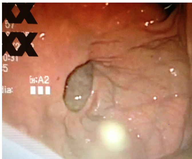
Fig. 1. Endoscopic view of a 2 cm opening at the base of the diverticulum.

System, Covidien company, USA), was placed across the base of the diverticulum, which was resected by executing the linear stapler (Fig. 3). The stapler row was over sewn by a running suture with resorbable coated polyclacin 3–0 suture (Vicryl™, Ethicon Norway) and reinforced by a tegmentation with an omental flap. Finally, by installation of 100 ml methylene blue sterile water into the stomach, no leakage was suspected, and the procedure was successfully completed without any technical difficulties. The postoperative period was uneventful. The patient resumed an oral diet over the next few days, and was discharged from the hospital on the fourth postoperative day.