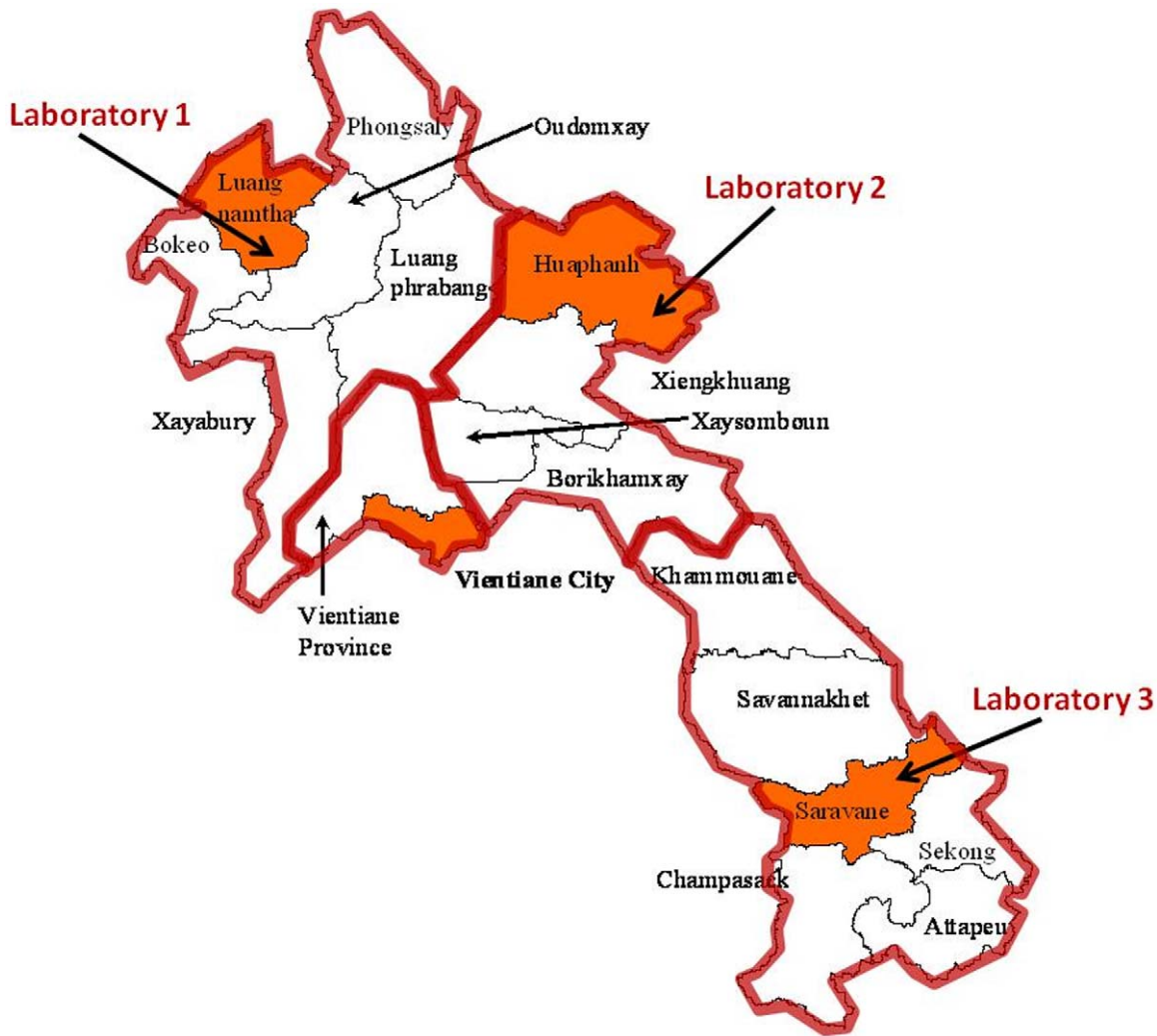
Figure 1. A map of Laos showing provinces. Vientiane and the provinces suggested for sentinel laboratories 1, 2 and 3 are marked in orange. doi:10.1371/journal.pone.0044545.g001