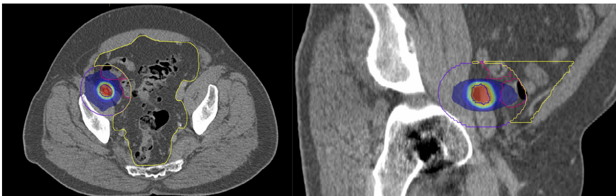
Fig. 3. Axial and sagittal slice showing dose distribution in relation to the PTV 3/2cm expansion. Dark blue colourwash represents the 10 Gy isodose.

This process can be used for abdomino-pelvic SABR using a conventional linac but is also relevant for MR-linac treatments, when rapid re-contouring for online adaptation is required [10]. The process may also be relevant for non-SABR targets (where the target does not include the whole pelvis) but this should be formally evaluated. Situations where mean bowel loop dose constraints are also used are likely to require contouring of the entire bowel structure, although the whole bowel bag could potentially be used as a time saving alternative. A 3/2cm expansion was used around the PTV in