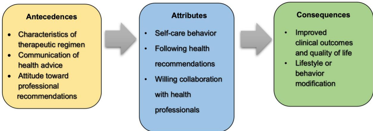
Figure 1 Antecedents, attributes, and consequences of patient compliance

greater intake of vegetables and fruits, smoking cessation, and moderation of alcohol consumption (Ogbemudia & Odiase, 2021) (Figure 1).