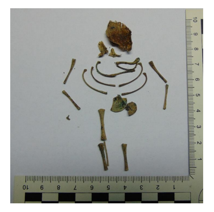
Figure 1. The remains of a human fetus (case 4).

Case 5: A female fetal corpse (290 g, 29 cm, 18–22 weeks pregnancy) in a state of advanced putrefaction was found on a balcony in a plastic pot. The corpse was covered with a brown colored blanket and placed in a plastic bag. The suspect mother of the child stated that she had miscarried approximately 4–5 months earlier.