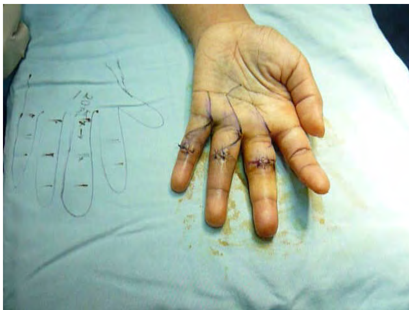
Video 1. FAHS to support injection kit 1. This video can be watched by clicking on to the figure or on YouTube at https://youtu.be/6XoNManP1wc