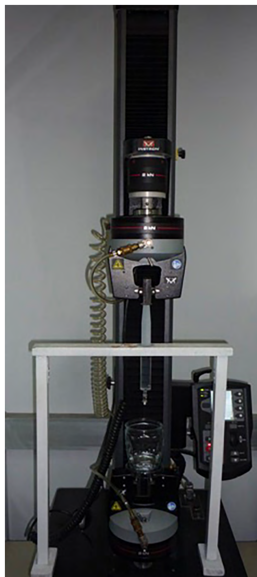
Figure 1. The Instron 5940 device is a single column tabletop model testing system to measure the initial and the maintenance force of the syringe and needle pairs

5 mL, and 10 mL with the original needles from the packaging (Terumo Corporation, Tokyo, Japan), respectively. The 1 mL syringe originally pairs with a 26G needle; the 3 mL with 23G, 5 mL with 22G and the 10 mL with 21G. Only the 20 mL syringe did not come with an original needle pair. All syringes were also combined with a 27G needle, 30G needle (Terumo Corporation, Tokyo, Japan), and 27G spinal needle (B Braun Medical Inc, Melsungen, Germany). Combinations of the syringes and needles were tested three times in the machine.