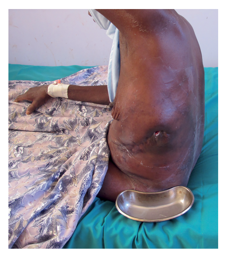
Fig 1. Photograph of the patient showing the chest wall lesion with the sinus.

https://doi.org/10.1371/journal.pntd.0005737.g001