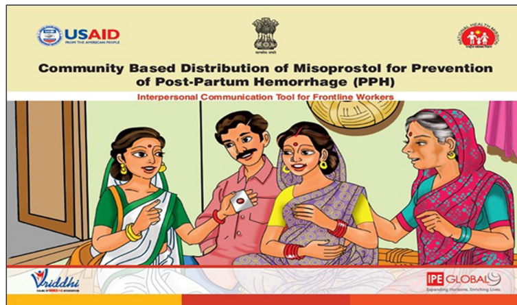
Fig. 3 The Inter-Personal Communication flipbook designed for the intervention

The ANMs of the respective HSCs were involved as field depots to supplement the ASHA with tablets if required.