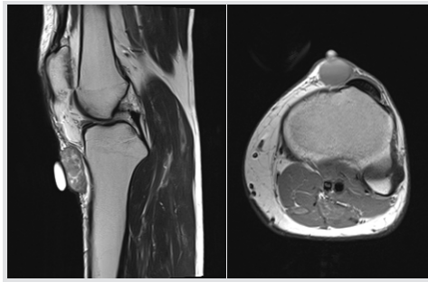
Figure 2: Pre-operative magnetic resonance images of leiomyosarcoma of the left knee. (a) Sagittal image, (b) axial image.