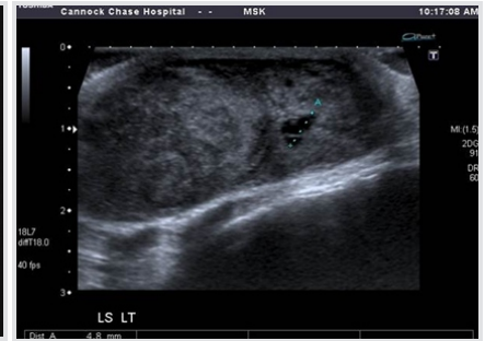
Figure 3: An ultrasound image of leiomyosarcoma of the left knee.