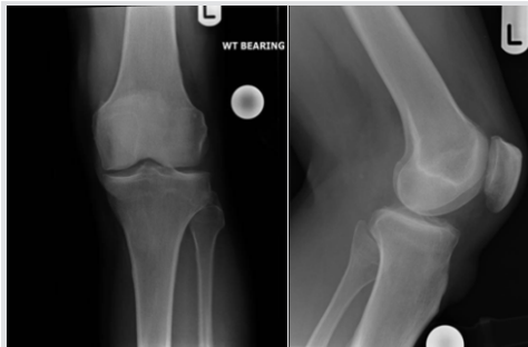
Figure 1: A plain radiograph of the left knee, (a) AP view, (b) lateral view.