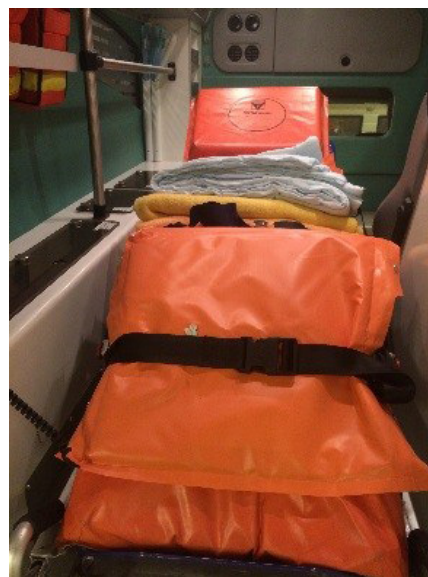
Fig. 1. The heated mattress on the stretcher connected to 12 V electrical system.

An infrared thermometer measured the finger temperature with dual laser points indicating the measurement area, (CIR8819). Measurements were taken approximately 7 cm from the measurement surface (3.5 cm \varnothing ). Accuracy: \pm 1^{\circ}\text{C} or \pm 2\% . Resolution: 0.1^{\circ}\text{C} . The Ear tympanic temperature was measured by using an infrared light thermometer (Braun Thermo Scan, Exac temp IRT 8520, Germany) after 10 minutes in the ambulance compartment. Accuracy: \pm 0.2^{\circ}\text{C} (35.5–42 ^{\circ}\text{C} ). Resolution: 0.1^{\circ}\text{C} . The ambulance compartment temperature was measured after 10 minutes by an external sensor (Bead probe 6030) connected to the infrared thermometer (CIR8819). When the participants had been lying on the stretcher for 10 minutes, they were asked if they experienced the stretcher to be warm or cold when they initially lay down and now how they experienced it.