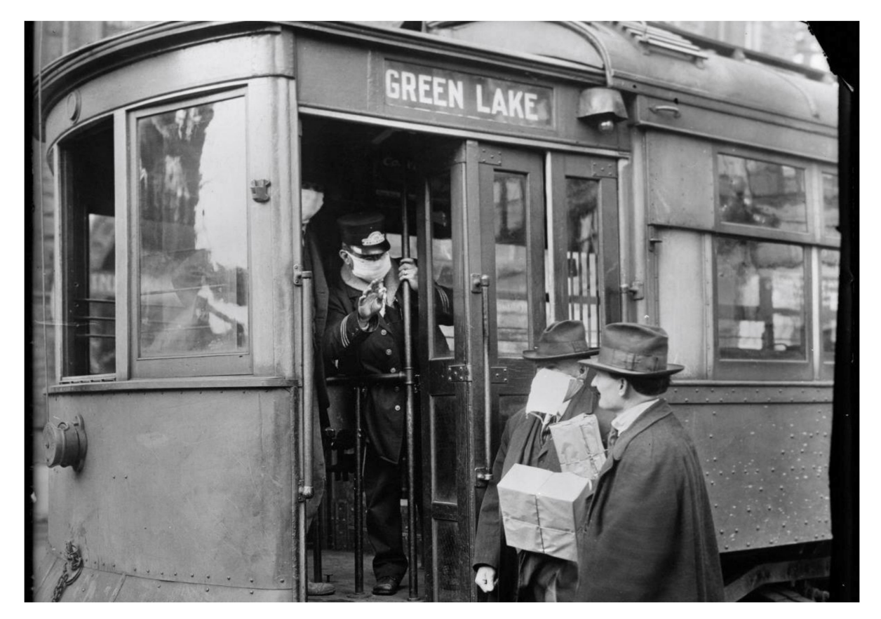
Figure 1. Seattle (Washington) streetcar conductor checks passenger face masks during the 1918 influenza pandemic [28].