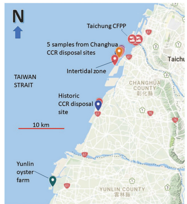
Figure 1. Locations of the 12 aquatic samples collected are pinpointed in the Google map for trace element contamination survey in Central Taiwan, including 3 near the Taichung CFPP, 5 from the Changhua CCR disposal site, 2 from the historic CCR disposal site, and 2 from the background seawater (intertidal zone and Yunlin oyster farm). CCR indicates coal combustion residual; CFPP, coal-fired power plant.

Taichung CFPP is the world's second largest operating power plant with an annual coal consumption of 21 million