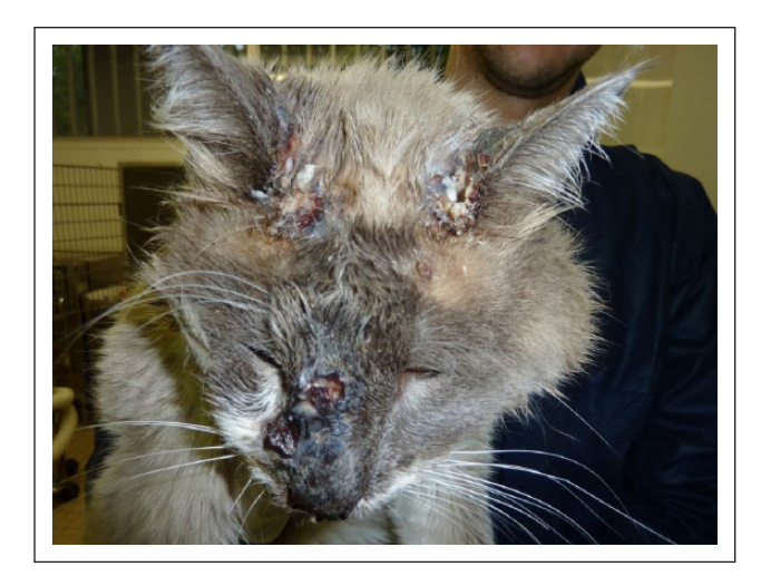
Figure 1 Ulcers on the face of cat 12

Cat 10 presented to the ER on Wednesday 5 October for dysorexia and exhaustion (no precise diagnosis was ever established). It was never hospitalised, but presented during the time when cat 5 was present. After 9 days, on Friday 14 October, it was admitted to the quarantine area for fever, lingual ulceration and icterus. The cat was euthanased on 27 October, 22 days after its first admission.