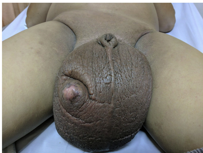
Fig. 1. Pre-operative clinical scrotal appearance.