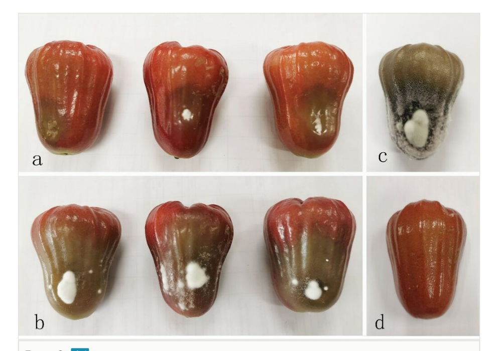
Figure 3. doi Symptoms developing on Syzygium samarangense fruits inoculated with Lasiodiplodia syzygii . a. Symptom at 3<sup>rd</sup> day; b. Symptom at 5<sup>th</sup> day; c. Symptom at 7<sup>th</sup> day; d. Control.

At the third day after inoculation, water-soaked areas with a few white hyphae began to appear on all inoculated fruits similar to the naturally-infected wax apples (Fig. 2a and Fig. 3a). The water-soaked symptom of diffusion with abundant hyphae producing mycelium further appeared on inoculated Syzygium samarangense fruits after five days (Fig. 3b). At the 7th day after inoculation, the symptoms spread throughout the fruit (Fig. 3c), together with many white mycelia and more hyphae accompanied by cytoplasmic exosmosis. The control fruits (Fig. 3d) did not show any symptom. The fungi were re-isolated from the lesions of inoculated wax apple fruits and the re-identified (GUCC 9719.3 and GUCC 9719.4) sequencing four gene regions.