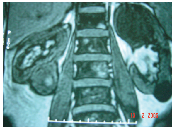
Figure 1 - MRI - solid mass 5.2 cm in higher dimension located in right kidney with same hemorrhagic foci and no sign of perirenal invasion

The cytology of a few cases has been described 1 and is composed of tight, short papillae and loose sheets of cells with scant cytoplasm, round nuclei, fine chromatin and rare small nucleoli. By analyzing all described findings at immunohistochemical and lectin histochemical studies, MA has shown reactivity for keratin (CK7 is the most common), CD 57, vimentin, S-100 protein, EMA, lysozyme,