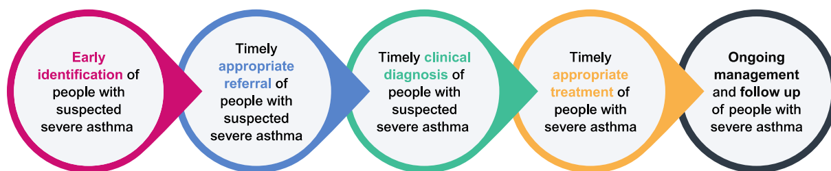
Fig. 1 The scope of the Global Quality Standard encompasses principles to address the unmet need and burden in severe asthma, with the intent to deliver improved care for patients with severe asthma

and advocacy groups, and asthma patients. Second, while aspirational, these standards should also be achievable by most well-equipped health care systems in developed countries. For optimal success, standards must be tailored to local requirements; therefore, national and local clinical groups worldwide must agree to and interpret standards for successful implementation. Accordingly, an implementation plan should be agreed upon by local leaders, and progress regarding process, outcomes, and uptake must be measured locally. Finally, this initiative is intended to allow for the comparison of standards achieved across health care systems, and to support the continual development and improvement of these systems to support improved patient care and outcomes. To that end, this document proposes both a list of potential metrics and areas in which localization is required to ensure optimal engagement and uptake. This article is based on Task Force consensus and does not contain any studies with human participants or animals performed by any of the authors.