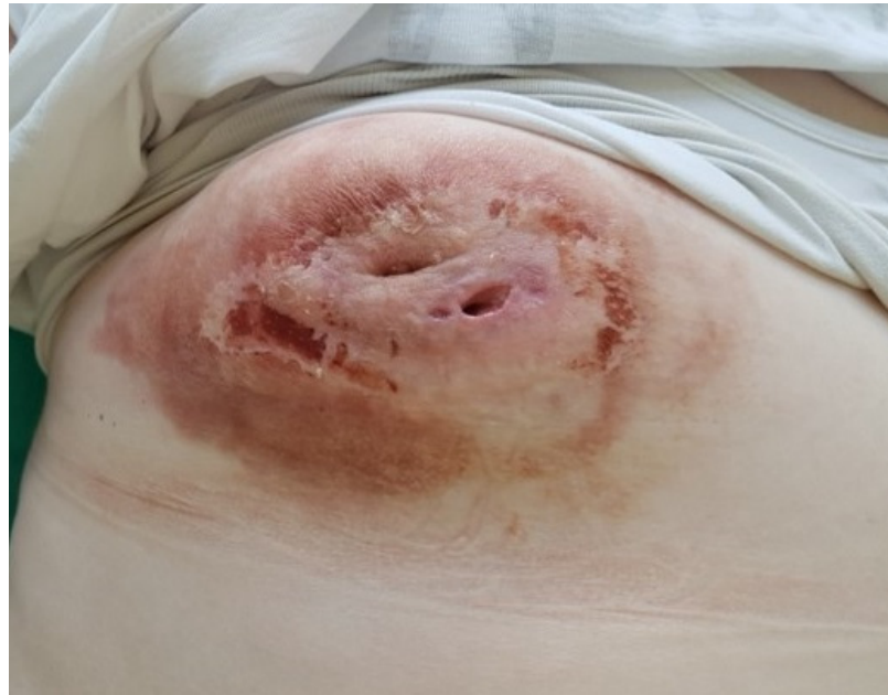
Figure 4. The right breast image at the end of therapy, after the evacuation of the purulent contents. Visible numerous fistulas and mild redness. Retraction of the nipple still present.