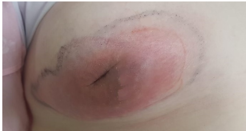
Figure 1. The clinical picture of the right breast tumor. Visible swelling, redness, and retraction of the right nipple.