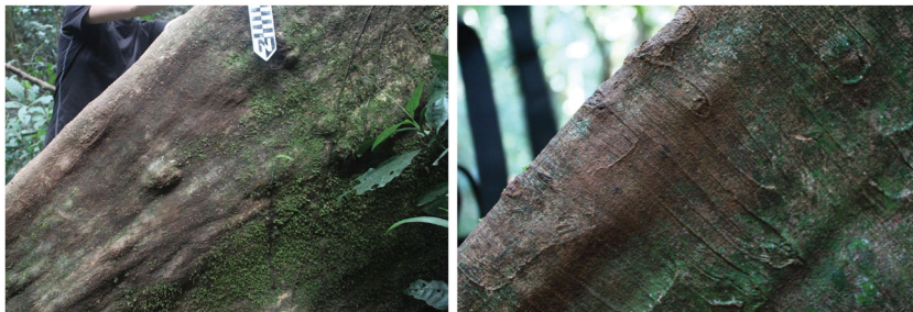
FIGURE 3 Drumming traces (dirt residue and noticeable wearing of buttress surfaces) are present on two drum trees.