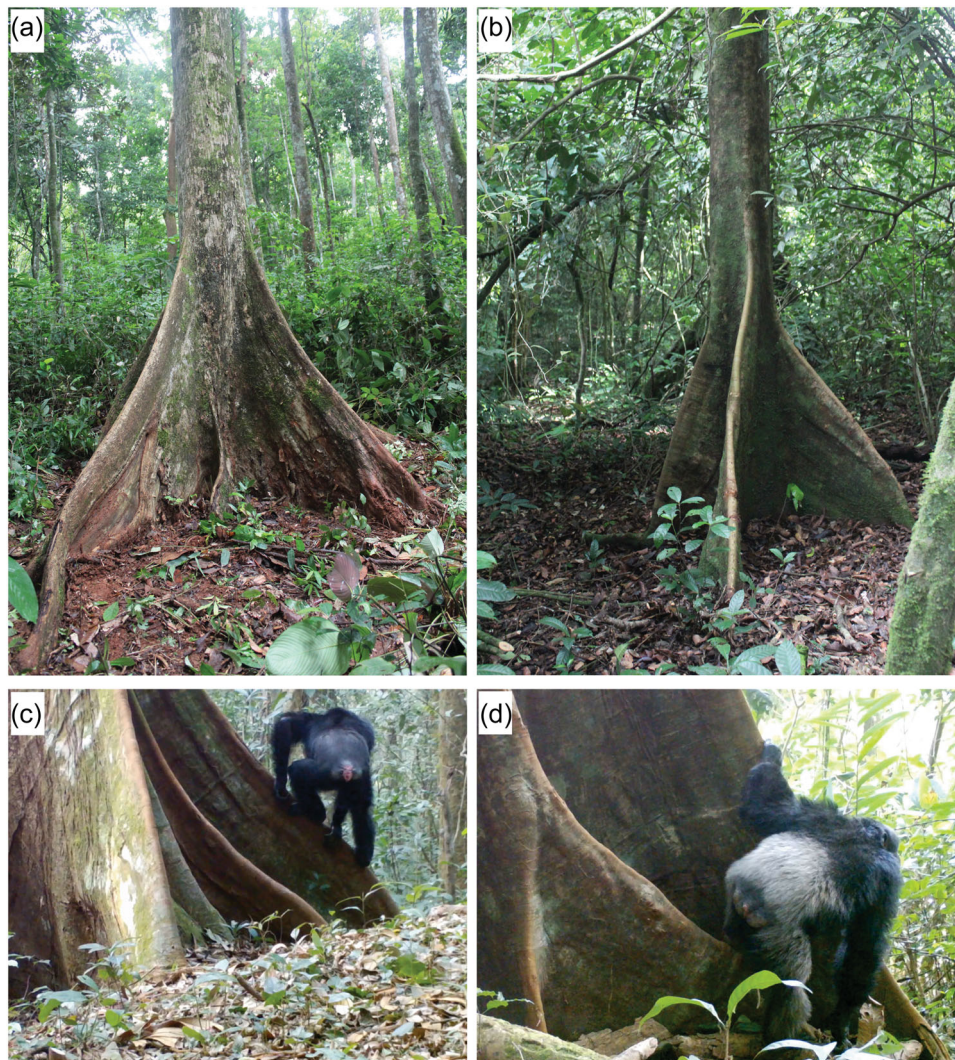
FIGURE 1 Four buttressed trees in the Nimba Mountains, Guinea. The top two photos (a and b) are pictures of drum trees taken by the research team. Photo (a) is of Terminalia superba and photo (b) is of Parkia bicolor . The bottom photos (c and d) are still shots from motion-triggered camera trap videos after chimpanzees drummed. Photo (c and d) are of Piptadenia africana . (Photos © M. Fitzgerald). Visit https://youtu.be/rUWncJMlaZY and https://youtu.be/U5BpFAL5GNo for videos of (c and d) (respectively)

Chimpanzees drum (hit) on tree buttresses, large above-ground roots (Figure 1), with hands and/or feet (hereafter buttress drumming) to produce acoustic signals (Goodall, 1968, 1986; Reynolds & Reynolds, 1965; see https://youtu.be/rUWncJMlaZY and https://youtu.be/U5BpFAL5GNo for drumming videos). These low-frequency drum sounds, that oftentimes occur in sequence with pant hoot vocalizations, are presumed to play a role in long-distance communication between separated individuals and are often associated with travel (Arcadi et al., 1998, 2004; Arcadi & Wallauer, 2013; Babiszewska et al., 2015; Boesch, 1991b). Yet, the function of buttress drumming is not fully understood. In addition to long-distance communication, it has also been referred to as a dominant display behavior (Goodall, 1968, 1986; Nishida et al., 1999). Buttress drumming occurs in all studied wild chimpanzee populations and is