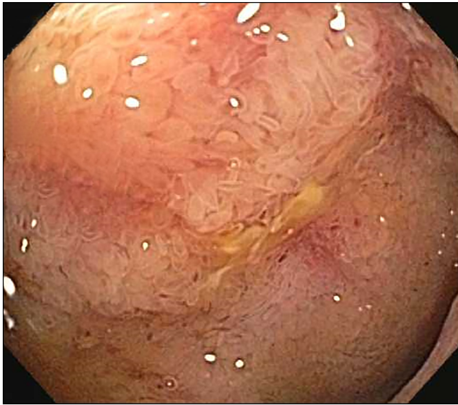
Figure 1. Colonoscopy in March 2015 showing aphthous ulcers <0.5 cm in diameter, 10–30% ulcerated surface, <50% affected surface, and no narrowing (SES-CD: 4).

more extensive ulceration (Figure 2). The SES-CD in the TI was 7 (ulcers 0.5–2.0 cm in diameter, >30% ulcerated surface, 50–75% affected surface, no narrowing).