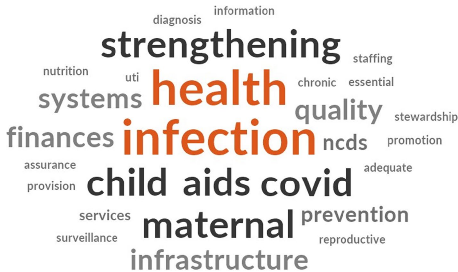
Figure 2. Respondents' Perceptions of Malawi Health Sector Priorities