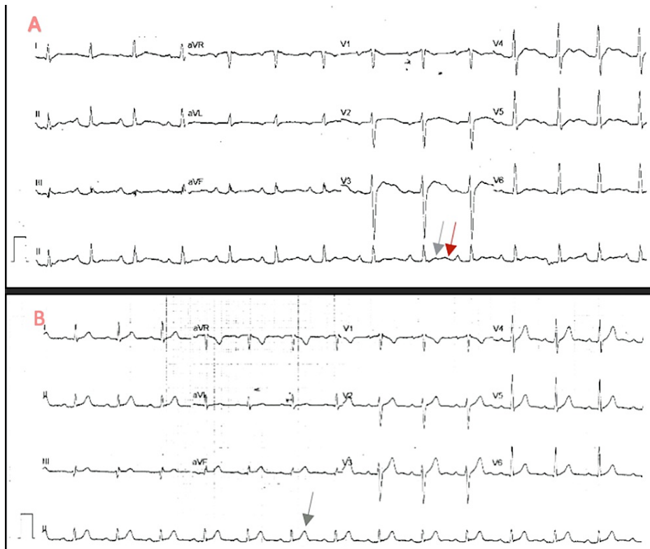
FIGURE 1: (A) An initial ECG on arrival: regular sinus rhythm with a heart rate of 100 beats/ minute as well as flattened T wave (gray arrow) and U wave (red arrow). (B) ECG after electrolytes correction showing the normalization of T wave (arrow) and disappearance of U wave.