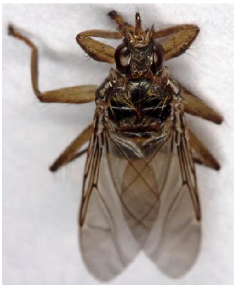
Fig. 3. Pseudolynchia canariensis removed from Columba livia