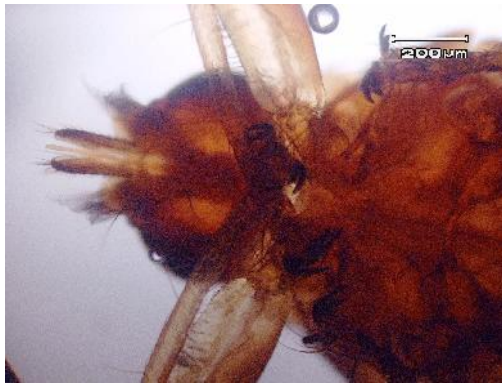
Fig. 1. Head, mouth appendix and palpi of Pseudolynchia canariensis