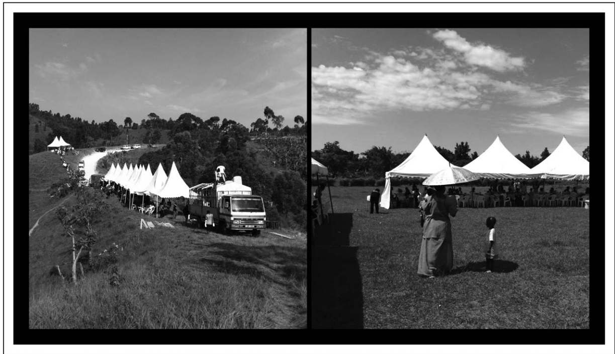
FIGURE 2. Photos of SEARCH Multidisease Community Health Fairs: (a) setting up health fair tents along a hilltop in Southwestern Uganda (photo to the left); and (b) a woman and her two children attending a health fair in Eastern Uganda (photo to the right). SEARCH, Sustainable East Africa Research in Community Health.

during testing to treatment transitions is higher – is critical to the success of UTT. During SEARCH health fairs, a healthcare worker (clinical officer or nurse) from the local government clinic and peer educators (PLHIV who volunteer at clinics) were in attendance, to ensure that each person diagnosed with HIV received an introduction to the clinic staff at the time of testing positive, and to assist with rapid linkage to care and ART initiation [10 ¶ ]. In keeping with the principle of nts with a positive screen for any condition, whether hypertension, diabetes or HIV, met with a staff member to receive a clinic appointment. At home visits, persons with a new HIV diagnosis talked with a clinic staff member via mobile phone to receive a welcoming introduction to the clinic.