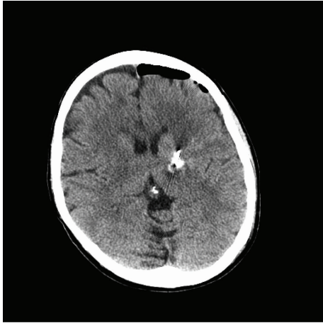
FIGURE 1: CT head demonstrated a small hemorrhage at the tip of the lead.

demonstrated no benefits. Revision surgery was recommended.