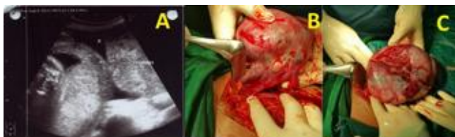
Figure 2: Dysgerminoma Ultrasound and Macroscopic Finding Durante Operation. Case 2. A. USG showed hypo-hyperechoic left adnexa mass 11.17x8.16 with papillae at 29w2d GA; B. and C. Durante operation: solid mass mixed with cystic 19 cm x 16 cm x 13 cm in size, arising from left ovarium

left salpingo-oophorectomy and omentectomy, frozen section and cytological test) at 30w gestation through a midline abdominal incision. The operation revealed a solid ovarian mass admixed with a cystic component 19 cm x 16 cm x 13 cm in size. Internal abdominal evaluation of the uterus was consistent with 30w gestation, the right and left Fallopian tubes were normal, the right ovary was normal, and there were no nodules on the peritoneum, omentum, and liver (Figure 2). The result of the histopathological assessment of left ovary was a dysgerminoma with a round to oval shape atypical cells separated with complex thin fibrous tissue septal network. Ascitic fluid cytology was positive for malignant cells, but no malignant cells were found in the momentum. The patient was staged as a FIGO Stage IC dysgerminoma ovarian cancer. No fetal anomalies were detected on feto-maternal ultrasound examination before treatment.