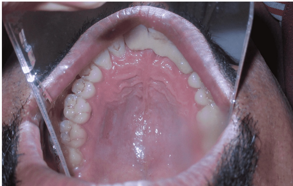
FIGURE 11: Post-operative evaluation at three months (donor site)