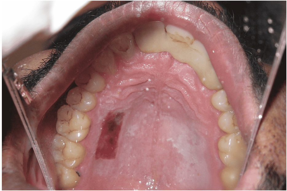
FIGURE 9: Post-operative evaluation after two weeks (donor site)

A post-operative evaluation was done again after three months (Figure 10, Figure 11).