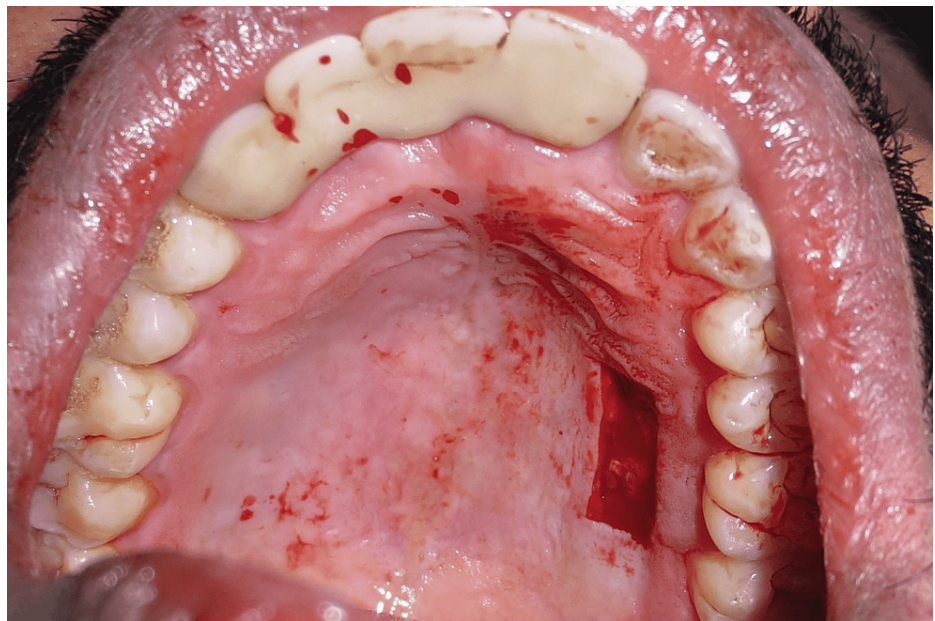
FIGURE 4: Free gingival graft harvested from the palate

A free gingival autograft was harvested from the palate (Figure 4), the primary purpose of which was to achieve more attached gingiva and to obtain a thicker gingival phenotype.