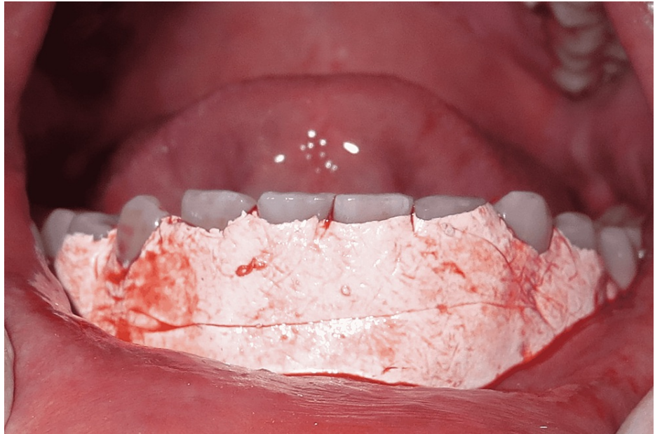
FIGURE 7: Placement of COE-PAK™