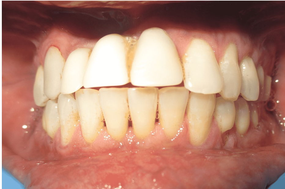
FIGURE 1: Pre-operative photograph