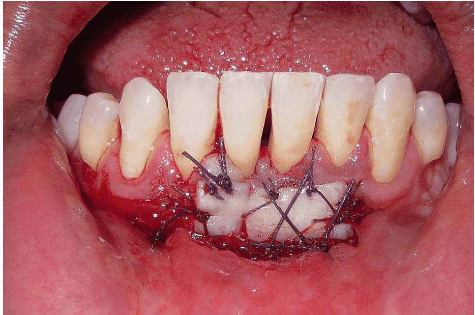
FIGURE 5: Free gingival autograft stabilized using 5-0 Vicryl

A sterilized tin foil is placed to prevent the adherence of COE-PAK™ (GC Corporation, Tokyo, Japan) to the surgical site (Figure 6, Figure 7). COE-PAK acts as a physical barrier protecting the wound from the oral environment.