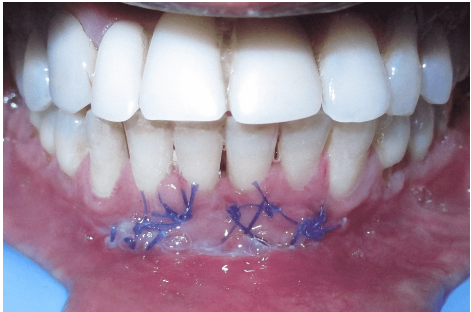
FIGURE 8: Post-operative evaluation after two weeks

The Coe-Pack was removed after 14 days. A post-operative evaluation was done after two weeks (Figure 8, Figure 9).