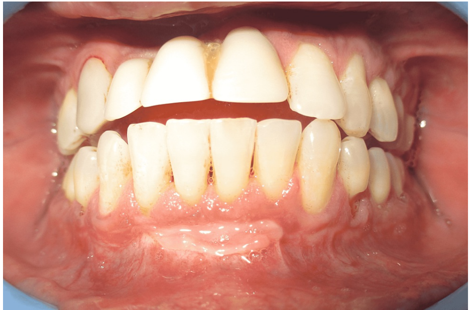
FIGURE 10: Post-operative evaluation at three months

A post-operative evaluation was done again after three months (Figure 10, Figure 11).