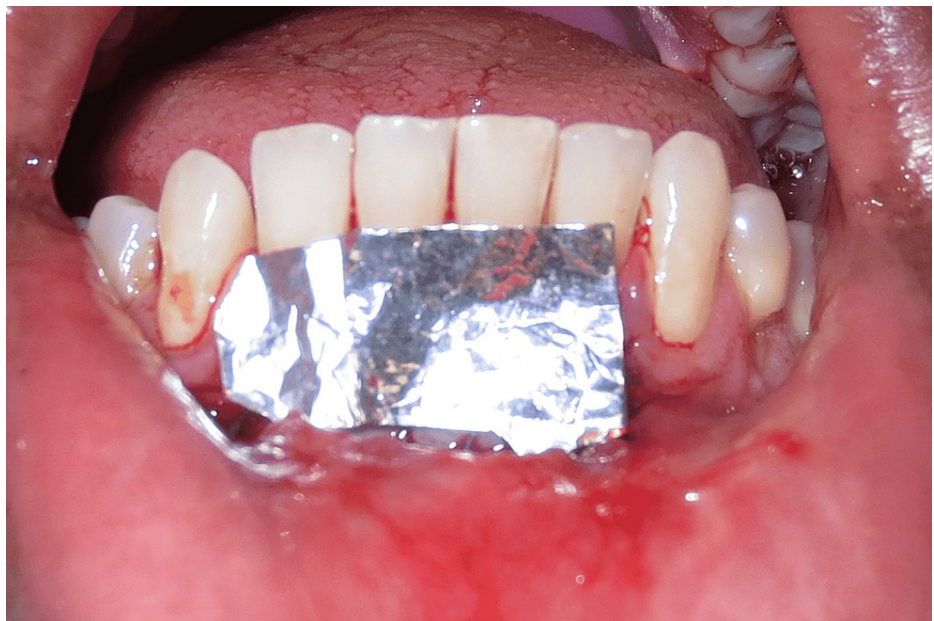
FIGURE 6: Placement of sterilized tin foil

A sterilized tin foil is placed to prevent the adherence of COE-PAK™ (GC Corporation, Tokyo, Japan) to the surgical site (Figure 6, Figure 7). COE-PAK acts as a physical barrier protecting the wound from the oral environment.