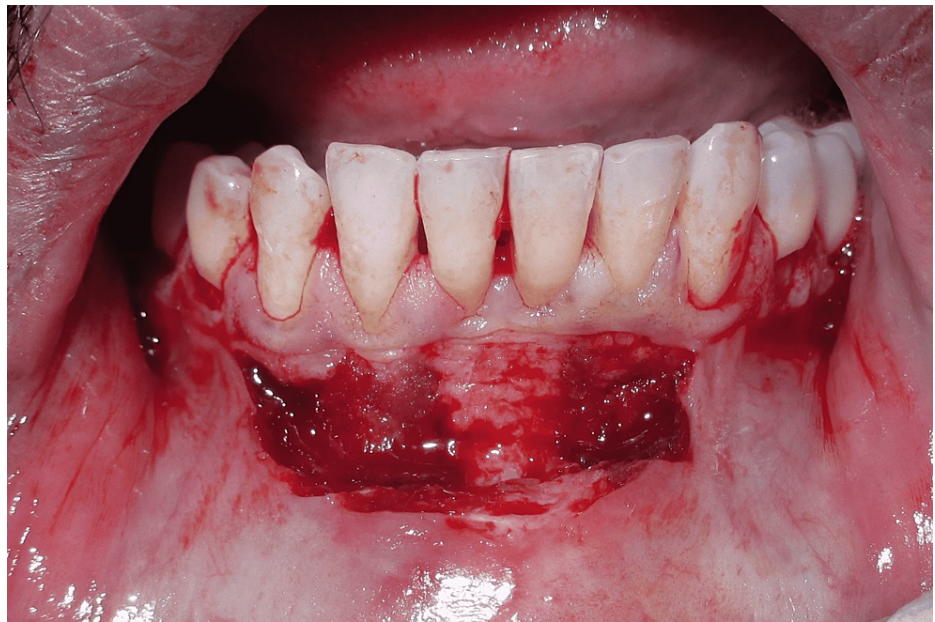
FIGURE 3: Vestibuloplasty incisions and reflection

A free gingival autograft was harvested from the palate (Figure 4), the primary purpose of which was to achieve more attached gingiva and to obtain a thicker gingival phenotype.