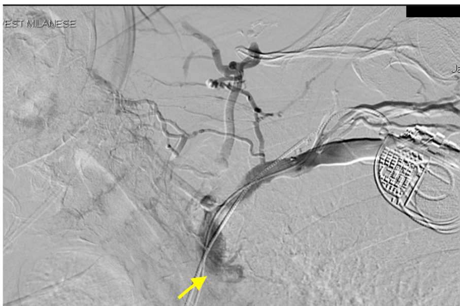
Fig. 3 superior cavography showing a minus image in superior vena cava (arrow) around indwelling leads, with increased flow through the collateral circulation (indirect thrombus demonstration)