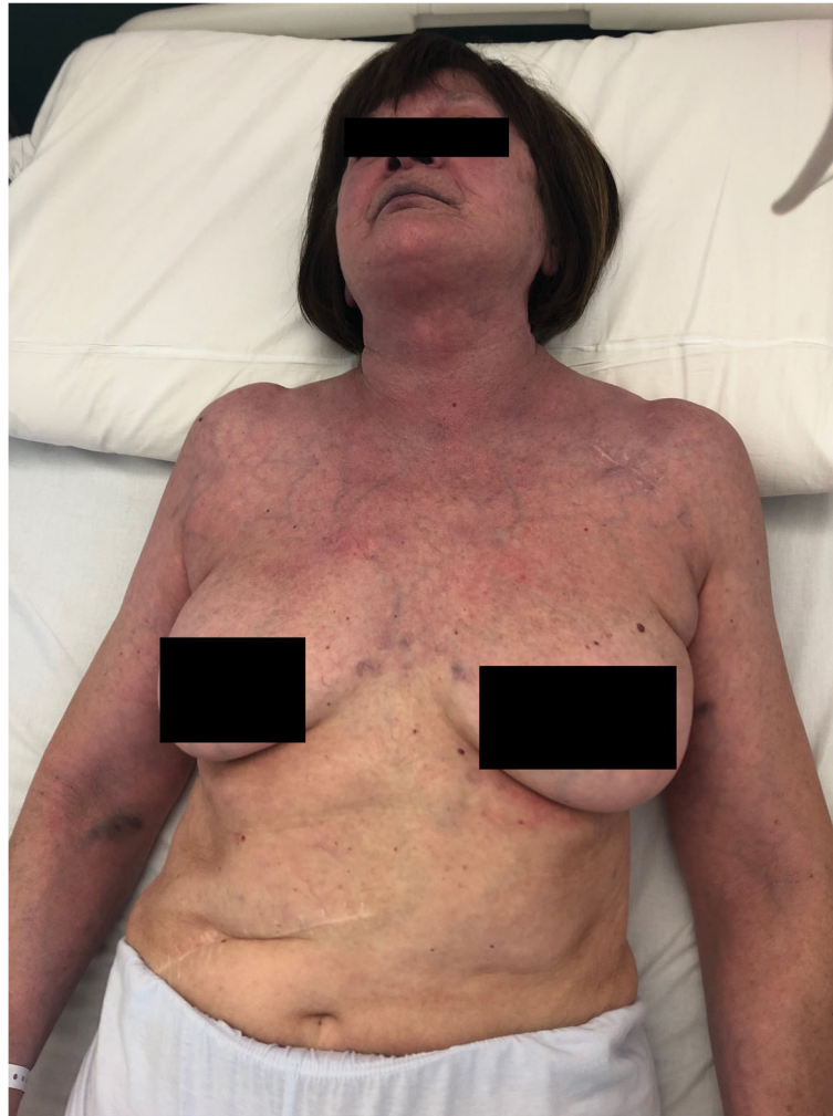
Fig. 1 The image show cyanosis, edema and prominent engorged vasculature in the face, neck, bilateral upper limbs and anterior chest wall

the symptoms was obtained. The patient was discharged in a stable condition 10 days later.