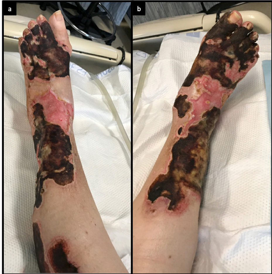
FIGURE 1: Bilateral (a) right and (b) left lower extremity necrotic, ulcerating wounds with black-brown eschar.

to the bilateral lower extremities for three months. These ulcerations initially began as a small area of erythema on the right ankle that progressed to a blister and subsequent skin erosions. She underwent surgical excision and autografting at this hospital to address these concerns. Postoperatively, she had total graft loss and was begun on prednisone. In the outpatient setting, she was tapered off of her prednisone regimen and subsequently began to experience an acceleration of the disease process. She was then transferred to our regional burn center Intensive Care Unit for management of her non-healing wounds. Upon arrival at our burn center, she required bilateral escharotomy for her necrotic wounds. Her physical examination revealed tender, gangrenous wounds with a distinctive black-brown eschar (Figures 1a, 1b).