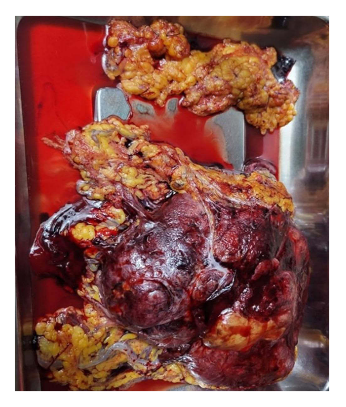
Figure 2 During the surgery, a large mass was discovered that infiltrated the greater omentum.

immunohistochemistry not always a reliable diagnostic tool.<sup>5</sup> On the other hand, hemangiopericytoma cells express antigens such as CD34 (100%), CD99, and Bcl-2 (70–90%).<sup>1,4,8</sup> STAT6 serves as a reliable immunohistochemical indicator for diagnostic purposes,<sup>9</sup> but in our case CD34 was present, whereas STAT6 was not present. In order to identify hemangiopericytoma it is essential to conduct an assessment including running necessary laboratory tests and carrying out imaging studies.<sup>10</sup> Magnetic resonance imaging (MRI) is a more effective tool than using a computer tomographic (CT) scan to assess the size of the tumor and how it interacts with tissues. In our case, we proceeded with the surgery after reviewing the CT scan results as the size of the lesion necessitated surgery due to rupture of tumor with intra-peritoneal bleeding regardless of the result of tumor type. Additionally, our hospital is currently experiencing resource constraints, and many patients are unable to afford extra investigations.