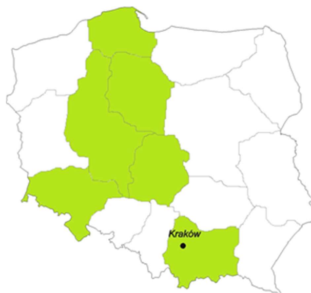
Figure 1. Regions involved in the study (projected on a map of Poland).

Patients from HAE centers located across Poland were enrolled into the study (Figure 1). Six centers accepted an invitation to participate in the survey: Krakow, Łódź, Toruń, Gdańsk, Wrocław and Poznań. All patients fulfilling the diagnostic criteria for HAE according to the current guidelines [2,22] were qualified for inclusion. We excluded from the study all patients under 18 years old and pregnant women due to ethical reasons and because pregnancy may strongly affect a clinical course of the disease [23]; thus, this could have impacted the representativeness of the results. Patients \geq 65 years of age were assigned to the “elderly” group according to the cut-off point used in the work of Bygum et al. [24] and in accordance with the recommendations of the European Union and the WHO [25]. The other patients formed the younger group.