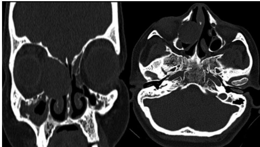
Fig. 2 (a) Coronal and (b) axial sections of non-contrast computed tomography of paranasal sinuses show expansile soft tissue density within the concha bullosa causing extreme thinning of the bony walls and mass effect on and thinning of the medial wall of right orbit and the nasal septum, suggestive of a mucopyocele of the concha bullosa. ►Fig 2a also shows obstruction of the right maxillary sinus drainage pathway with resultant chronic sinusitis.

turbinate. The MT is formed by the medial part of the ethmoid bone. The ethmoidal air cells extending into the frontal, maxillary, and the sphenoid paranasal sinus bones retain their ostia at the site of initial evagination. 7 The ostia remain as their drainage pathway. Anterior ethmoidal cells originating from the middle meatus pneumatize the MT in \sim 55\% of cases, which usually drain into the frontal recess. 8 Posterior ethmoid cells originated from the superior meatus pneumatize in \sim 45\% of the cases, and they usually drain into the retrobulbar recess. Most commonly, the drainage occurs through the conchal ostium present near the frontal recess region into which the frontal sinus drains. The CB becomes apparent after 7–8 years of age and continues its development even after the period of adolescence. 9 The degree of pneumatization and the inflammatory changes that occur within the CB may correlate with the presentation and the severity of symptoms. The mean age (30.3 years) of this study's participants with CB was consistent with other studies on the same topic. 10,11 The proportion of males was higher than that of females in our study, in contrast with other studies. 4,10,12,13 The prevalence of CB was 31.7% in our study. Aramani et al and Koo SK et al reported a prevalence