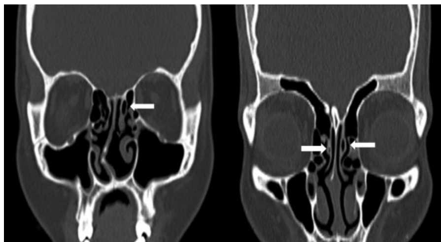
Fig. 4 (a and b) Coronal sections of non-contrast computed tomography scan of the paranasal sinuses showing pneumatized vertical lamella of left middle turbinate (lamellar type of concha shown with arrow). Incidental deviation of the nasal septum to the right side is noted.

moidal pyocele. Concha bullosa pyocele shows an enlarged tip or body of the MT that touches the nasal septum medially and bulges into the lateral wall of the nose laterally or into the medial wall of the orbit. Mucocoele of the ethmoid sinus usually displaces the MT inferiorly, against the septum. The MT is seen distinctly as an intact structure, but compressed. Any secretions within a CB will have a mucoid attenuation of 10–18 HU in the CT scan. The presence of a bony shell around the CB on a CT scan evaluation allows a conchal mucocoele to be differentiated from other nasal masses, but the bony rim may sometimes be absent or extremely thinned out due to bone remodeling in the pathogenesis of mucocoele (► Fig. 2 ). Concha bullosa mucocoele/pyocele can masquerade as an intranasal tumor, and it is very important to consider CB mucocoele/pyocele in the differential diagnosis.