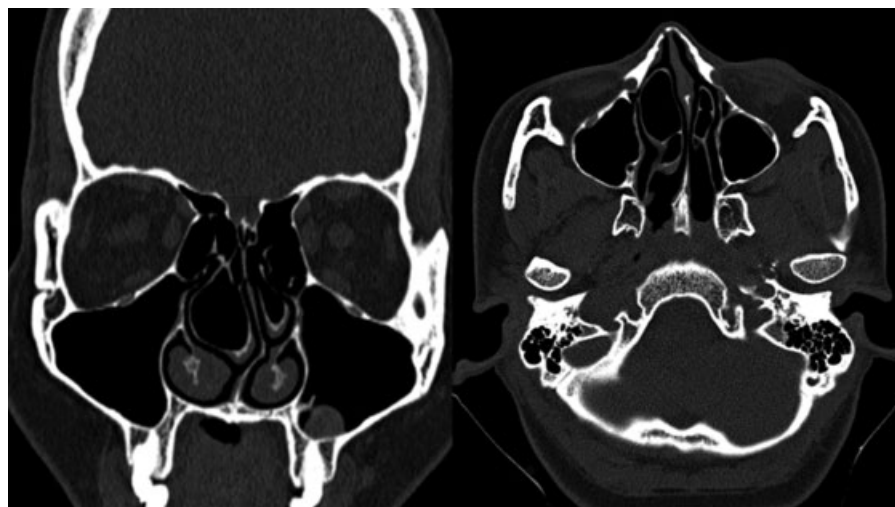
Fig. 3 (a) Coronal and (b) axial sections of computed tomography of the paranasal sinuses show the presence of multiple air cells within the bilateral concha bullosae. Deviation of the nasal septum to the left side is noted. Also seen is a small mucosal polyp in the inferior wall of the left maxillary sinus.

rate of 53.7% in their studies. 11,14 In our study, the MT CB prevalences of extensive, bulbous and lamellar types were 49 (49.5%), 28 (28.3%) and 22 (22.2%), respectively, which are the same as noted in a study by Tonai et al. 15 Various other studies report different incidences, which could be due to the differences in the target population and racial variation. 4,5,16