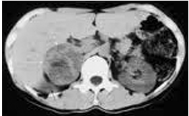
Figure 1: Computed tomography of the abdomen- showing a well defined, heterogeneously enhancing mass lesion of size 7.6 × 5.3 × 4.8 cm at the upper pole of right kidney without any calcifications. The left adrenal gland appeared to be normal

[Figure 3]. There was simultaneous enlargement of distal part of IVC.