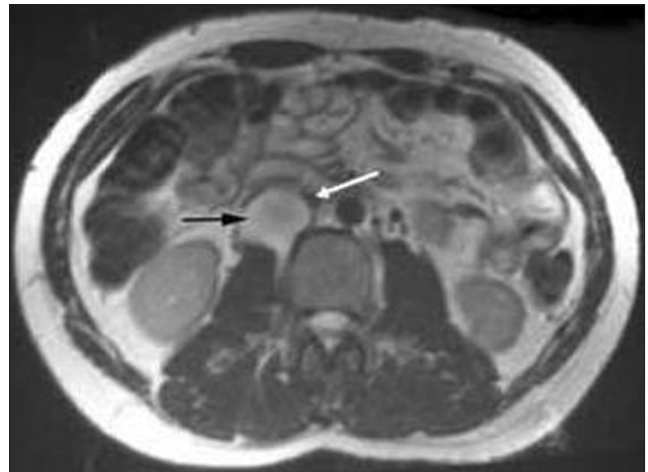
Figure 2: T2-weighted axial magnetic resonance imaging demonstrating the mass (predominantly high signal) between the inferior vena cava and right kidney (black arrow) compressing the overlying inferior vena cava (white arrow)