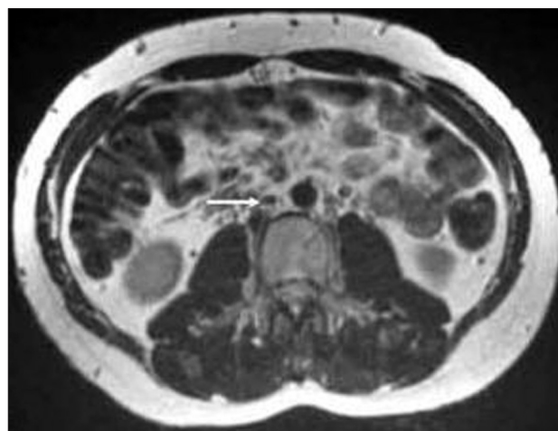
Figure 5: T2-weighted axial magnetic resonance imaging comparable in position and image acquisition to Figure 2 demonstrating complete resolution of inferior vena cava thrombosis (white arrow) after 4-months of oral anticoagulation therapy

pyrexia at presentation, with an associated elevation in D-dimer levels and inflammatory markers (white cell count, C-reactive protein). [12] Our patient had no lower limb, liver or kidney involvement, and this might be ascribed to the partial occlusion of IVC. He only had elevated inflammatory markers. We could not explain normal D-dimer levels in the backdrop of such a large thrombus in our patient.