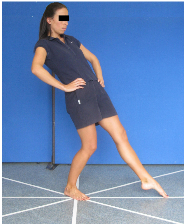
Figure 2 Participant performing anteromedial component of Star Excursion Balance Test on right leg, while leaning backwards and plantar flexing reaching foot. Right knee flexed to approximately 40°.

To be useful in clinical practice, the ART must demonstrate adequate measurement properties, including reliability, validity and responsiveness. 29 Reliability is often investigated first, being a prerequisite for the other properties. 30 In addition, it is recommended that initial studies of a new measure are conducted with healthy volunteers rather than patients, to exclude any variability