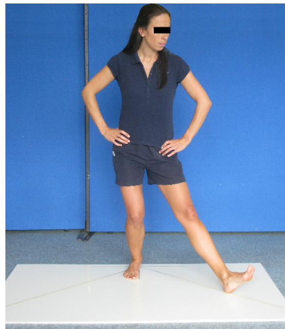
Figure 6 Anteromedial Reach Test performed on right leg.

Abbreviations: O, origin; RO, right oblique line; LO, left oblique line; T, transverse line; S, sagittal line; ART, Anteromedial Reach Test.