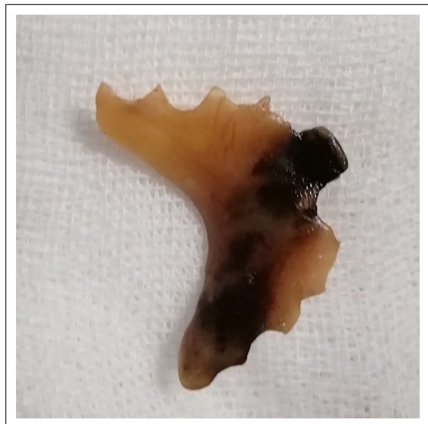
Figure 3. Foreign body esophagus (denture) post removal.

elderly followed by people with mental or neurological disorders. Studies have shown that food bolus, bones pieces, and dentures (4%–18%) were found more common in elderly and coins and toys more in children. 2 The cause of FB impaction in adult population has been found to be luminal narrowing of esophagus by webs, rings, strictures, tumors, achalasia, and esophagitis. In children, immature oropharyngeal coordination has been suggested. 4