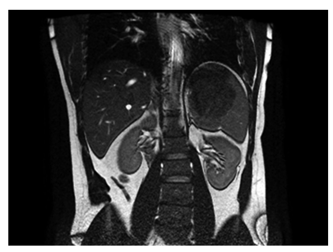
Fig. 1: Magnetic resonance imaging of the lesion on the superior pole of the spleen

Laparoscopic splenectomy was performed for the splenic mass. No complication occurred postoperatively, and the patient was uneventfully discharged on the 3rd day of surgery. Histopathology demonstrated