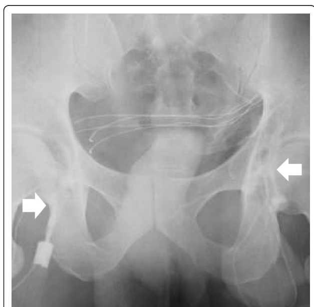
Figure 2 Bilateral vasography in which contrast medium was injected from into the vas deferens on the epididymal side. Both vasa deferentia were interrupted at the internal inguinal rings (arrows).

his wife strongly wanted to pursue the possibility of a natural pregnancy. Intra-operative vasography demonstrated that both vasa deferentia were interrupted at the internal inguinal rings (Figure 2). The abdominal end of the left vas could not be identified, but the abdominal end of the right spermatic duct was found in the abdominal cavity. The discharge from the stump of the testicular end of the vas had no sperm, whereas the right epididymal tubules were dilated with motile spermatozoa. Therefore, we performed a right-sided vasovasostomy