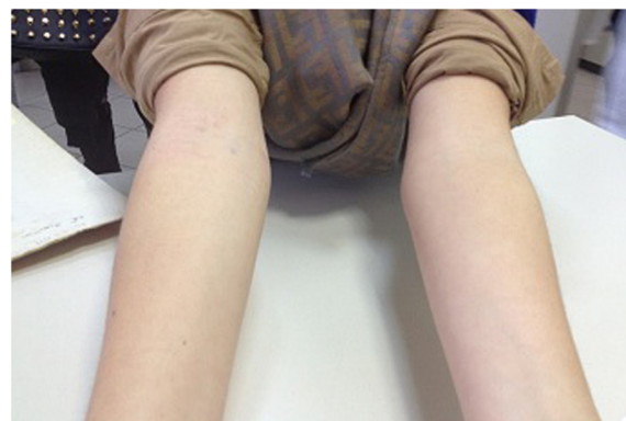
Figure 1 Etanercept led to a marked improvement in arthritis.