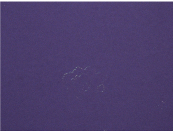
Figure 5 Green birefringence under polarized light in Congo red stained tissue.

Skin lesions, usually seen in primary systemic amyloidosis, are rare in the secondary form of the disease. In the literature review, some cases of oral and skin involvement were found in AA amyloidosis. 4,5