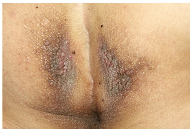
Figure 2 Confluent brown papules and plaques on the perianal area.

Type AA amyloidosis that complicates psoriatic arthritis is rare, and the published data are primarily based on case reports and are associated with increased mortality. 5,6 An early diagnosis of systemic amyloidosis is usually attained through an aspiration biopsy of abdominal subcutaneous fat. However, in cases of psoriatic arthritis, the diagnosis usually seems to be late and happens at the kidney disease stage, due to the rarity of amyloidosis in this rheumatological condition. 6