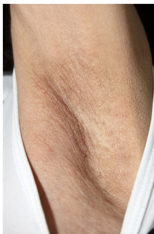
Figure 3 Brownish papules on the axilla.

Histopathological analysis of a vulvar papule and of salivary gland tissue showed deposits of amorphous hyaline substance that stained positively with Congo red and were birefringent when seen under polarized light, con-