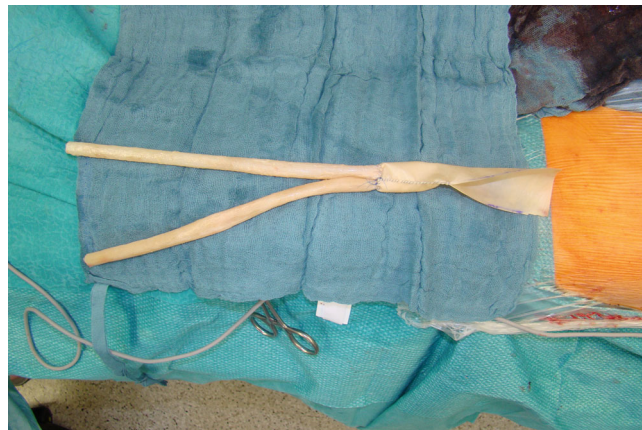
Fig. 4 ▲ An aortobifemoral composite graft is produced using a pericardial tube and two Omniflow II grafts (8 mm diameter)