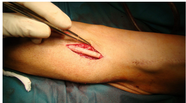
Fig. 2 ▲ Partial replacement of a graft shunt in the upper arm with a bovine tube due to an infected aneurysm