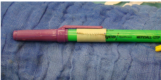
Fig. 1 ▲ A tube is produced from a bovine patch over an 8 mm diameter cylinder. Non-absorbable sutures are used. In cases where it is not possible to accurately determine the required graft length, the suture is left uncompleted approximately 1–2 cm from the end of the patch to be completed in situ

The German version of this article can be found under doi: 10.1007/s00772-016-0145-7