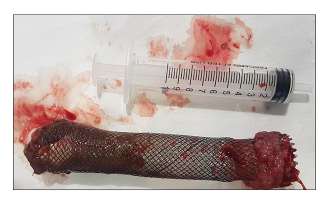
Figure 3 The removed stent (tissue ingrowth and overgrowth at both flanges)

We also found that fluoroscopy was useful in increasing the safety of the procedure by giving confidence about the correct location and position of the scope.