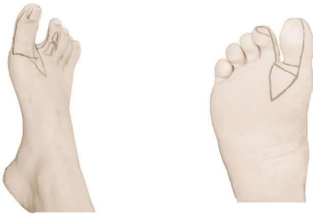
FIGURE 1 Design of the skin flap on the donor foot: nail flap designed on the back of the toe and on the sole of the foot and interphalangeal joint marked on the second toe