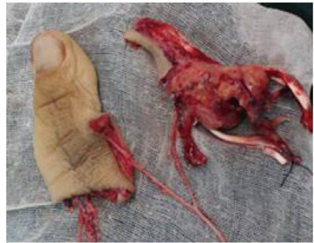
FIGURE 3 The great toe nail flap is on the left, including the toenail and the distal phalanx, the dorsal metatarsal artery vein, and the great toe fibular side artery nerves. On the right is the second interphalangeal joint, the second toe tibial side artery nerves, and the flexor and extensor toe tendons. The middle artery is an anastomosis of the fibular artery of the great toe and the tibial side artery of the second toe

STTF was used to reconstruct the affected finger. The average age of the patients was 31 years (range 24-44 years). The finger defects were a result of machine strangulation (n = 12), crush injury (n = 5), and necrosis after replantation of the thumb (n = 3). Our institutional review board approved the study, and all patients provided informed consent (Table 1).