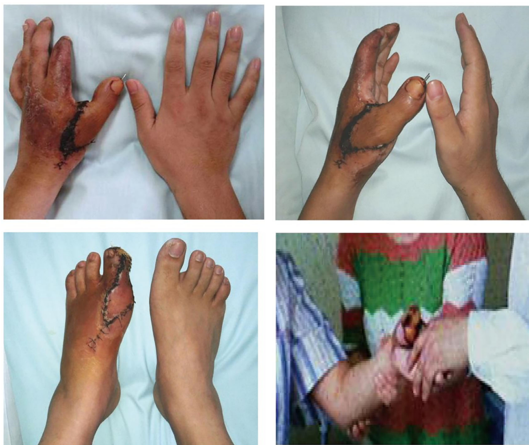
FIGURE 4 The top two images are postoperative photographs, the bottom left is a photograph of the donor foot, and the bottom right is a photograph of a patient shaking hands

The second phalanx was wrapped with the distal phalanx, and the distal phalanx was fused to the middle of the second phalanx. The two phalanges were sutured and fixed to form a reconstructed thumb, and the metacarpal and metatarsal bones were connected, fixed, and fused with Kirschner wires in an abducted and opposing position. Once the position of the fluoroscopic view was good, the Kirschner wires were fixed to place the finger in extension. The long flexor tendon of the thumb and the