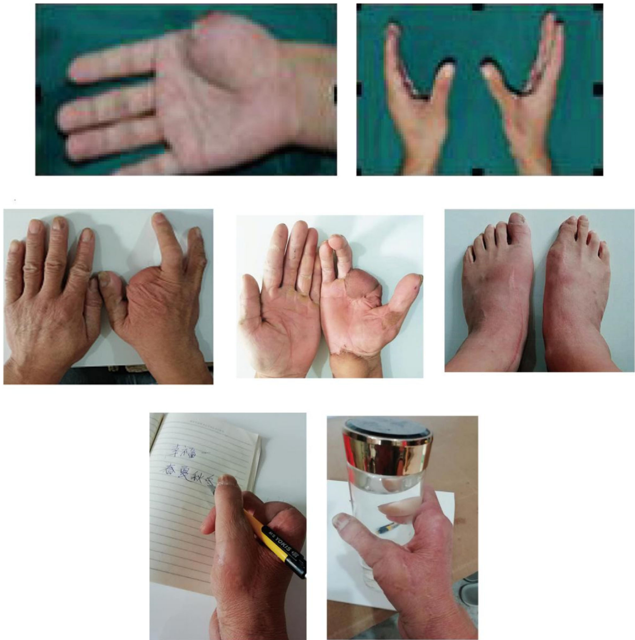
FIGURE 5 The upper two photographs were taken 2 years after thumb reconstruction; the middle three photographs were taken 3 years after thumb reconstruction upon re-examination, including both hand and donor site images; and the lower two photographs show that the right hand can write normally and pick up a teacup

toe long flexor tendon were sutured, followed by the long extensor tendon of the thumb and long extensor tendon of the toe. The dorsal foot flap was used to cover the skin defect. The nail flap nerve and second toe nerve were anastomosed with the proper thumb nerve, the great toe fibular side artery and the proper finger artery were anastomosed, the second toe artery and the branch of the radial artery were anastomosed, and the nail flap vein and dorsal hand vein were anastomosed (A:V = 1:2). The second toe vein was anastomosed with the dorsal hand