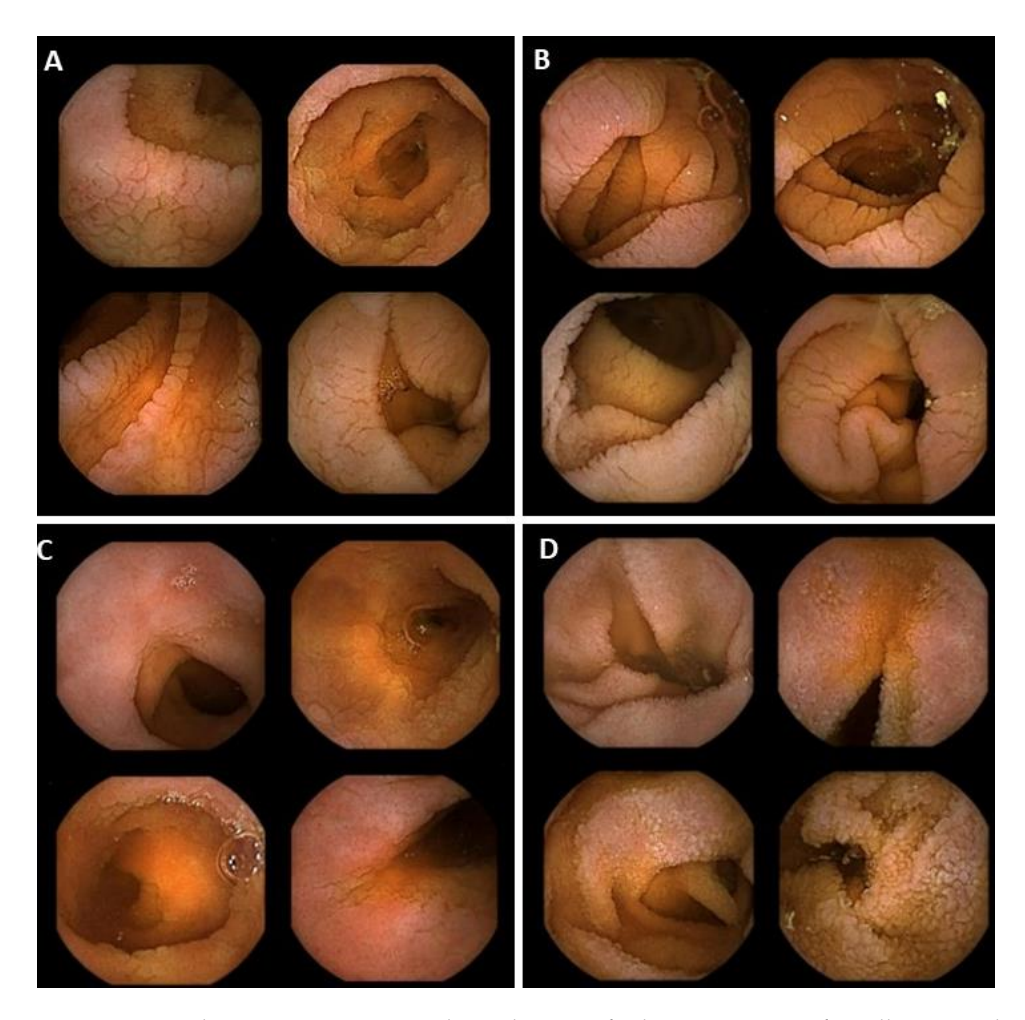
Figure 2. Agreed images representing the endoscopic findings suggestive for villous atrophy: mosaicism ( A ), scalloping ( B ), folds reduction ( C ), and granular mucosa ( D ).

the endoscopists in the upper quartile for numbers of SBCEs read per year were more prone to disagreement than the others, regarding the final set of proposed images for granular mucosa (p = 0.03).